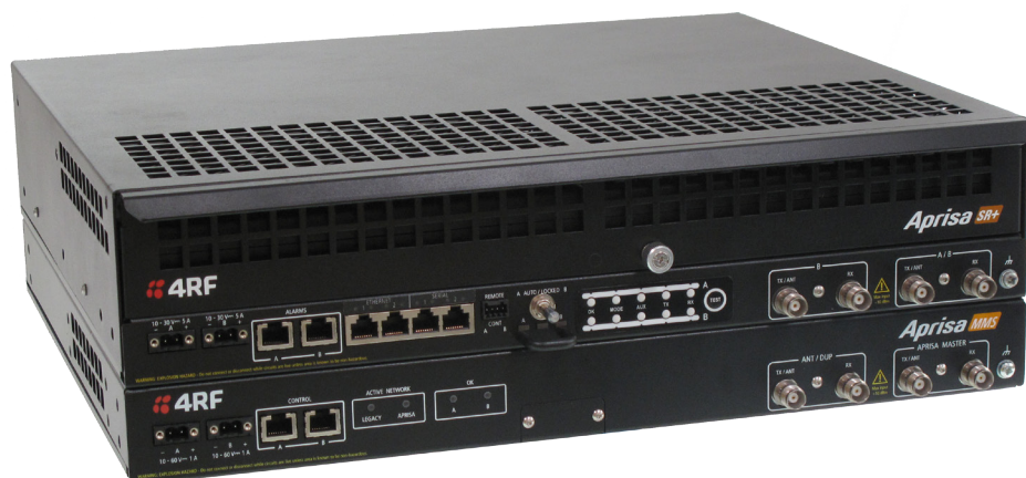
The Aprisa SR+ Migration Station